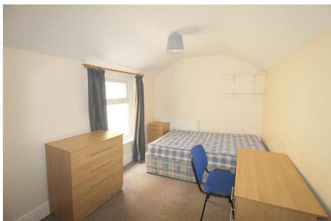
Bedroom 4 9'7" x 10'0" (2.93m x 3.06m)

Double glazed window to rear, coved ceiling, radiator.