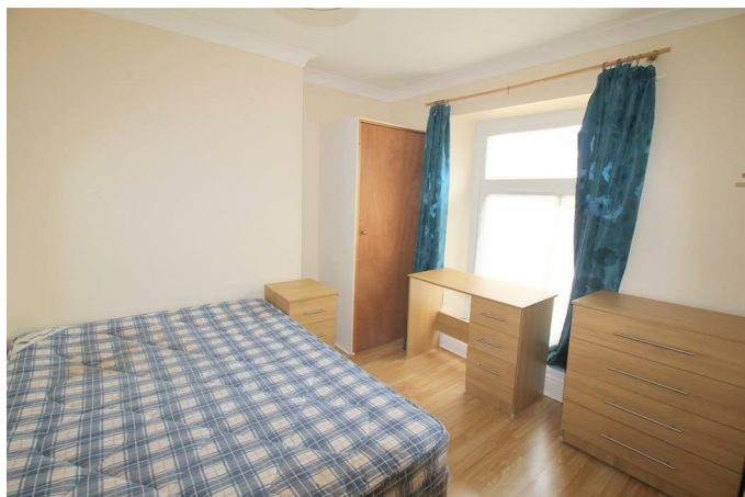
Bedroom 3 13'5" x 8'4" (4.09m x 2.55m)